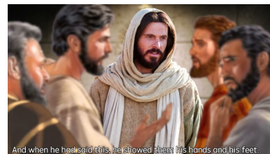
And when he had said this, he showed them his hands and his feet.

www.stjames-coorparoo.org.au/sundays-readings