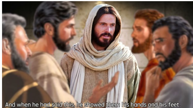
And when he had said this, he showed them his hands and his feet.

The disciples told their story of what had happened on the road and how they had recognised Jesus at the breaking of bread.