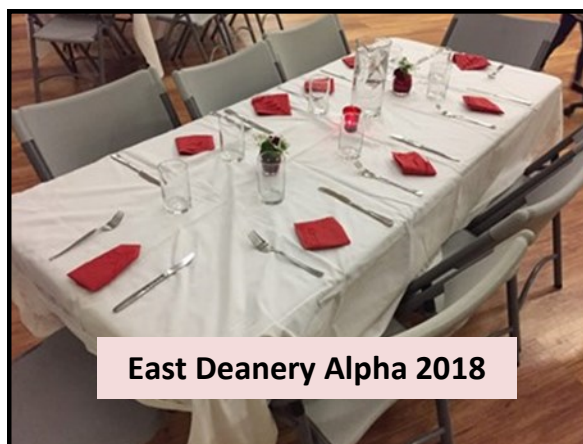
East Deanery Alpha 2018

Our Lady of Mt Carmel Primary School Hall Norfolk Street, Coorparoo QLD 4151