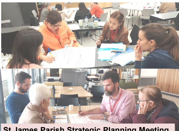
St James Parish Strategic Planning Meeting