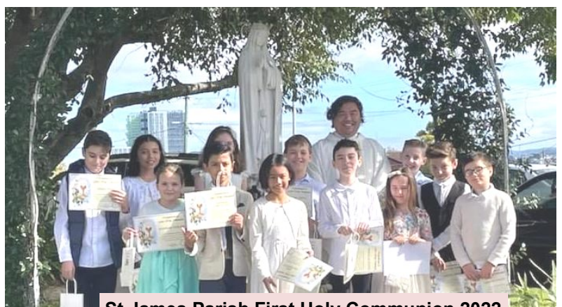
St James Parish First Holy Communion 2022