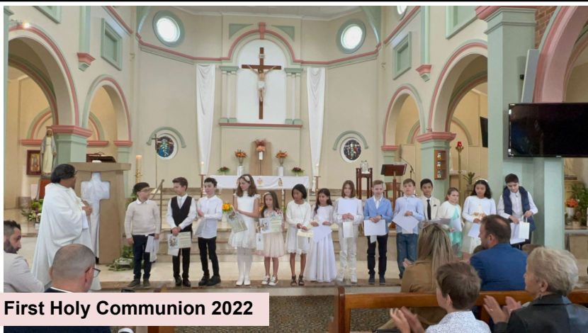
St James Parish First Holy Communion 2022