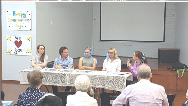
Social Justice Statement 2019 Launch at St James Parish Hall held last Wednesday, 25 September 2019.