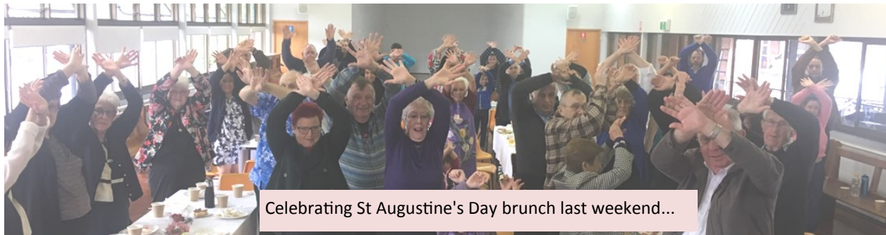
Celebrating St Augustine's Day brunch last weekend...