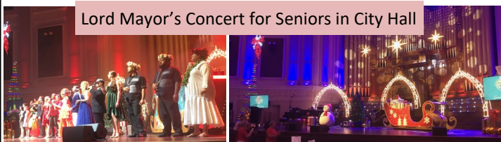
Lord Mayor's Concert for Seniors in City Hall