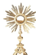
Baroque Monstrance (22.44in x 14.17in) (24kt Gold Plated) $2360 AUD