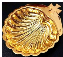
Baptismal Shell $65 AUD