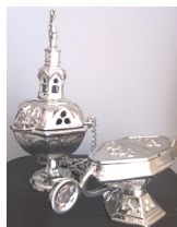
Thurible and Boat $445 AUD