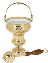
Aspergillum Set $690 AUD

Late last year, the parish ordered some new items from overseas (where they cost lower compared to when buying them here in Australia), although COVID-19 conditions on freights and delivery is causing some delays for their arrival. Be that as it may, we would like to appeal to your generous hearts. If you wish to make a donation towards any of the vessels or Sacramentals below, please contact the parish office by email, or by calling, to indicate your interest. Thank you very much for your continued support of our Parish!